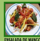
ENSALADA DE MANGO

with prawns, mango, peppers, lettuce, carrot tomato cherry, bean sprouts and nuoc cham sauce.