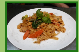
PAD KEE MAO