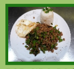
PAD KRA PAO