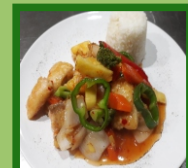
PAD PRIEW WAN