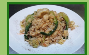
PAD SEE EW