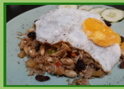
KAO PAD SAPPAROT