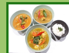
TYPES OF CURRY RED/YELLOW/GREEN WITH RICE