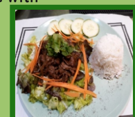
BO LUC LAC

Sautéed marinated veal in hoisin sauce, onion and garlic, accompanied with white rice.