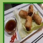
NEM DE CERDO