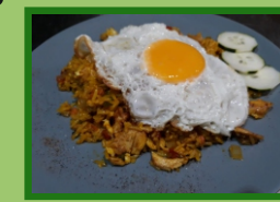
KAO PAD PONG GAREE AMARILLO