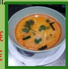
SOPA DE COCO