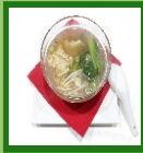
SOPA de WONTON

Pork dumpling soup, sprout s, scallion, carrot